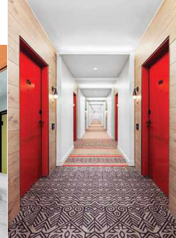
Opposite top: Every Virgin Hotels property has a presidential suite called Richard's Flat, after the company's owner, Sir Richard Branson; this one includes lime-washed walls and a custom wool rug. Opposite bottom: Lamb topiaries and faux-grass furniture, all custom, populate the events-space terrace; Top, from left: Guest bathrooms combine Carrara marble and oak. Along guest hallways of custom Axminster carpet, doors are lacquered Virgin red. Bottom: Pendant lanterns by Casamidy cluster above a custom sectional in the presidential suite's living room.