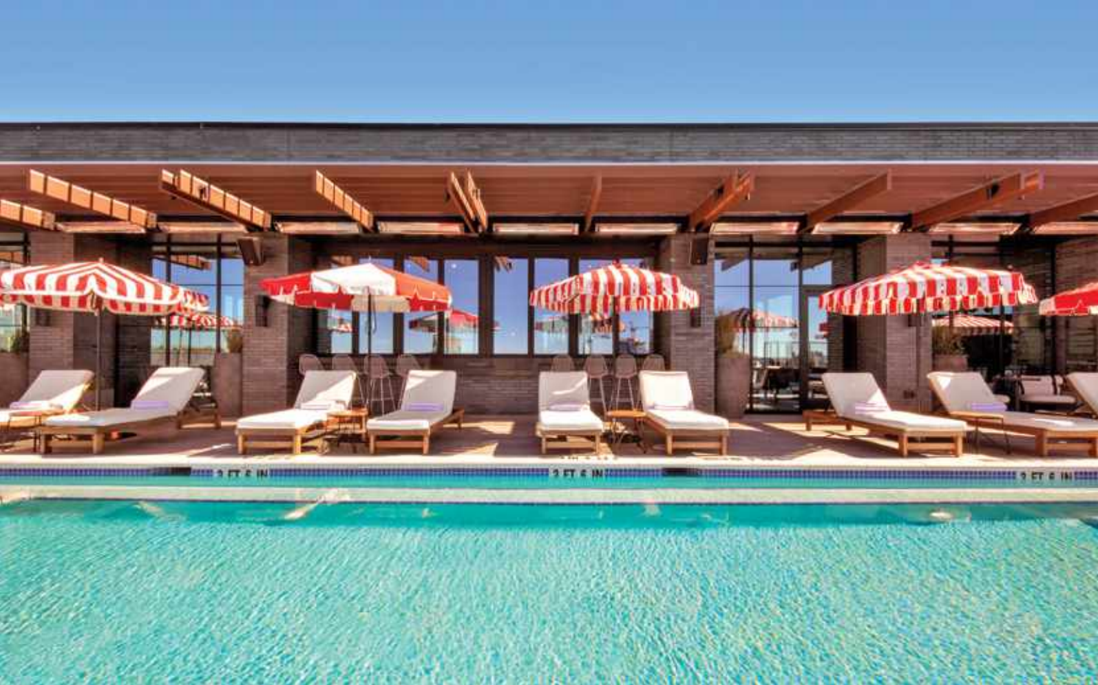
Opposite top: Custom teak chaise longues line the rooftop pool. Opposite bottom: Cowhide-strip wall covering and velvet upholstery join a shag rug in the Shag Room, the hotel's private lounge.