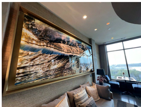
One of Chang's pieces in the main dining room of VAGA

The visions of Alila Marea's creators and Aaron Chang's designs merge here. As a guest of Alila Marea, each guest brings along their own story. These unique tales of human life are awakened by the senses, and realized in energetic forces of nature. Such connections are rooted in the dreamscape of Alila Marea, where sunlight warmly caresses your shoulders, the sea breeze rustles your hair and the ocean air expands your soul. In this divine sanctuary, where nature meets art and beauty, you can discover the true meaning of relaxation, gently release tensions, and reflect on your own vision and creativity – free, fluid, open, authentic. With Aaron Chang's art juxtaposed against the shimmering Pacific Ocean shining through the windows of Alila Marea, inspiration will inevitably emerge, and self-reflection will lead from head to heart, body to soul, and movement to energy... the synergy of humanity, art and nature.