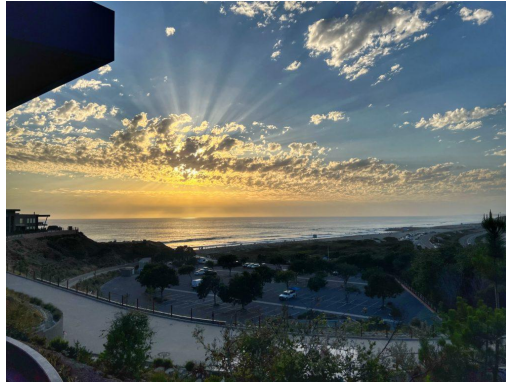
sunset from Alila Marea