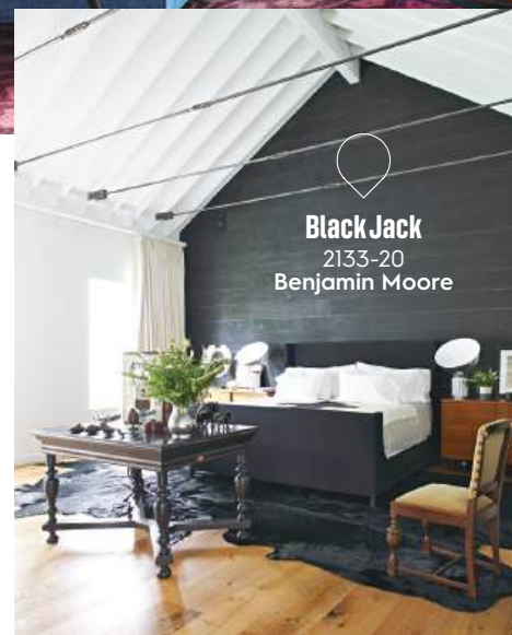
Black Jack 2133-20 Benjamin Moore